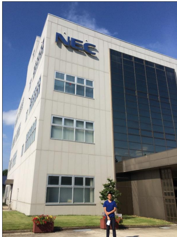
Fig 2. NEC Company.Yonezawa-Yamagata.