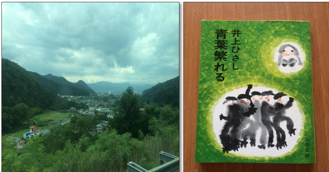
Fig. 1 a) Yamagata City .b)Inoue Hisashi's Book purchased in Yamagata.