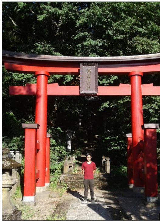
Fig 3. Kurokawa Temple Tsuruoka-Yamagata.