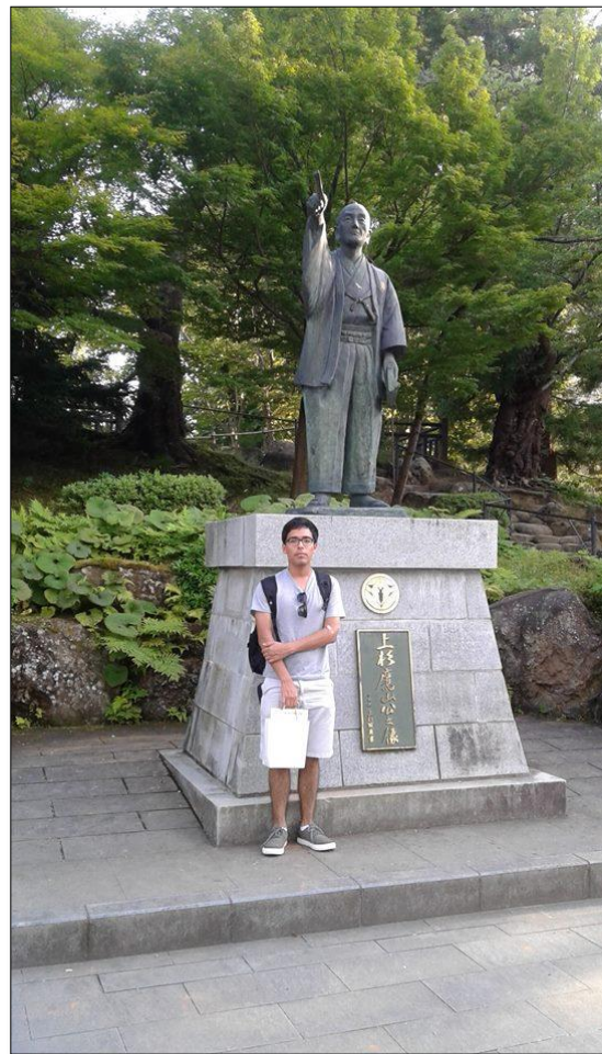
Fig 4. a) Tokyo Sky Tree b) Uesugi Kenshin Statue.