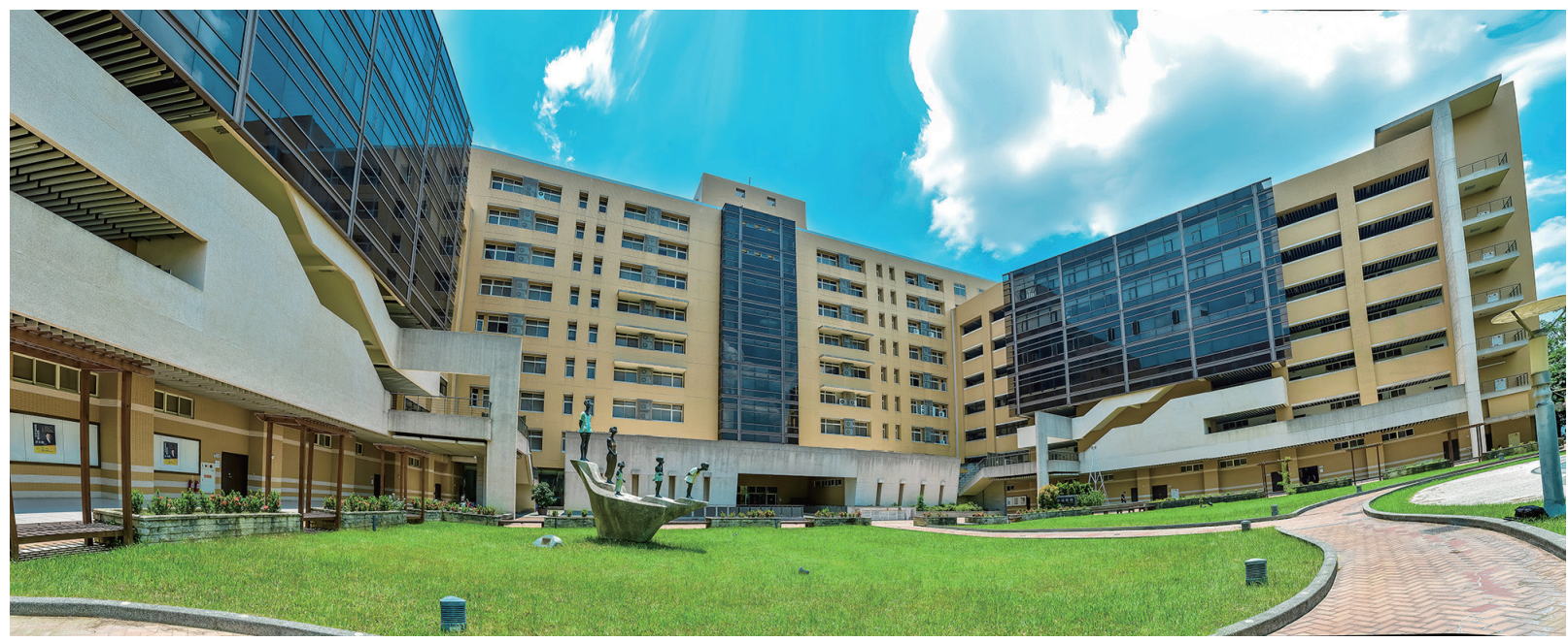
The building of College of Law and Politics in NCHU.